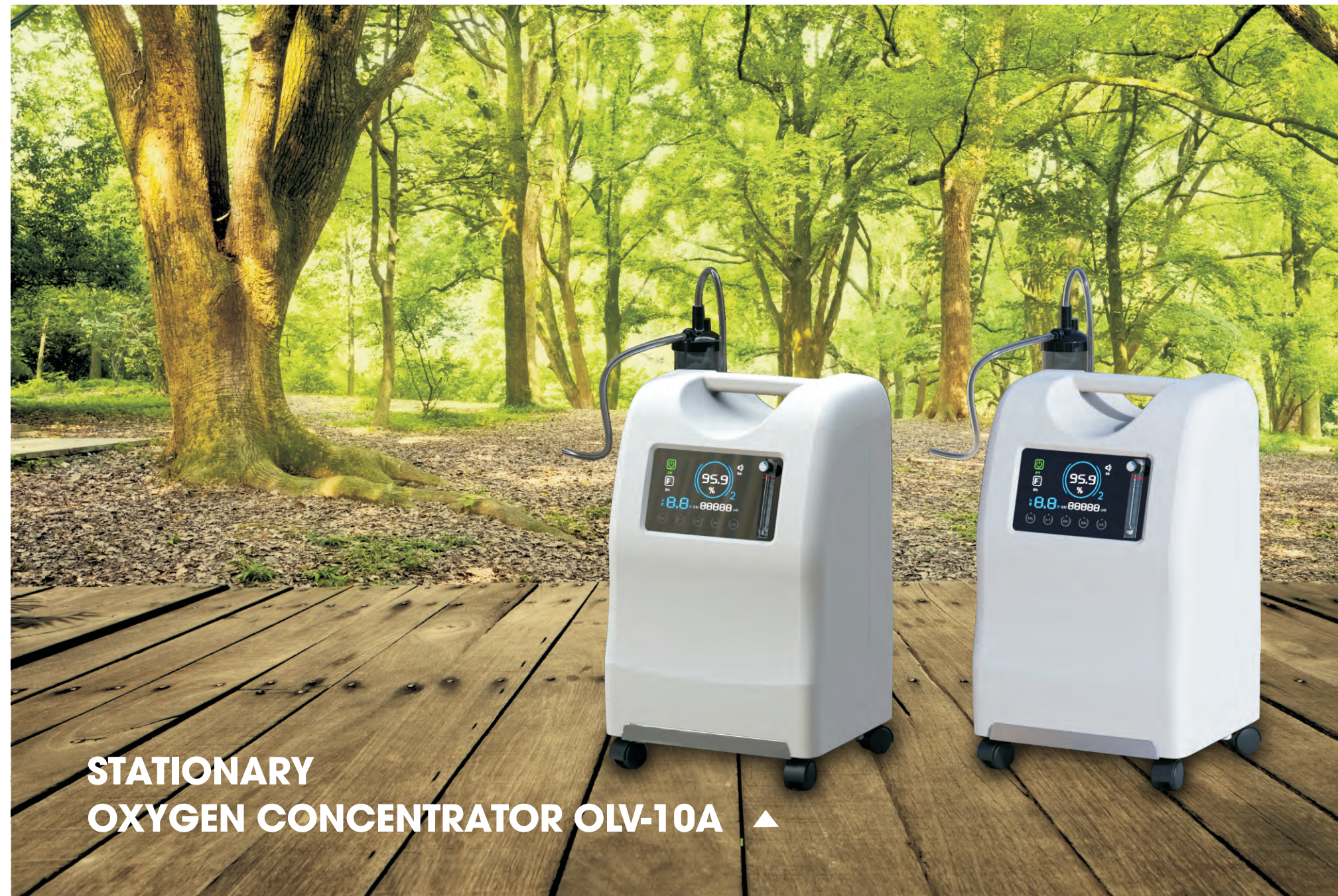
STATIONARY OXYGEN CONCENTRATOR OLV-10A ▲